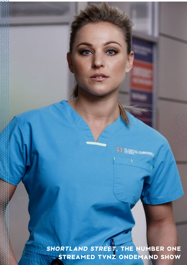
SHORTLAND STREET, THE NUMBER ONE STREAMED TVNZ ONDEMAND SHOW

TVNZ OnDemand has performed extremely well, with ongoing growth in total video streams and audience reach propelling online revenue growth of 26% year-on-year. Viewer experience has been enhanced with the launch of individual profiles, and the new 'ad on pause' functionality has increased value for advertisers. TVNZ is keeping pace with global scale online streaming competitors, illustrated by Horizon Research recognising TVNZ OnDemand as New Zealand's most used online content service during 2019, ahead of Netflix," he says.