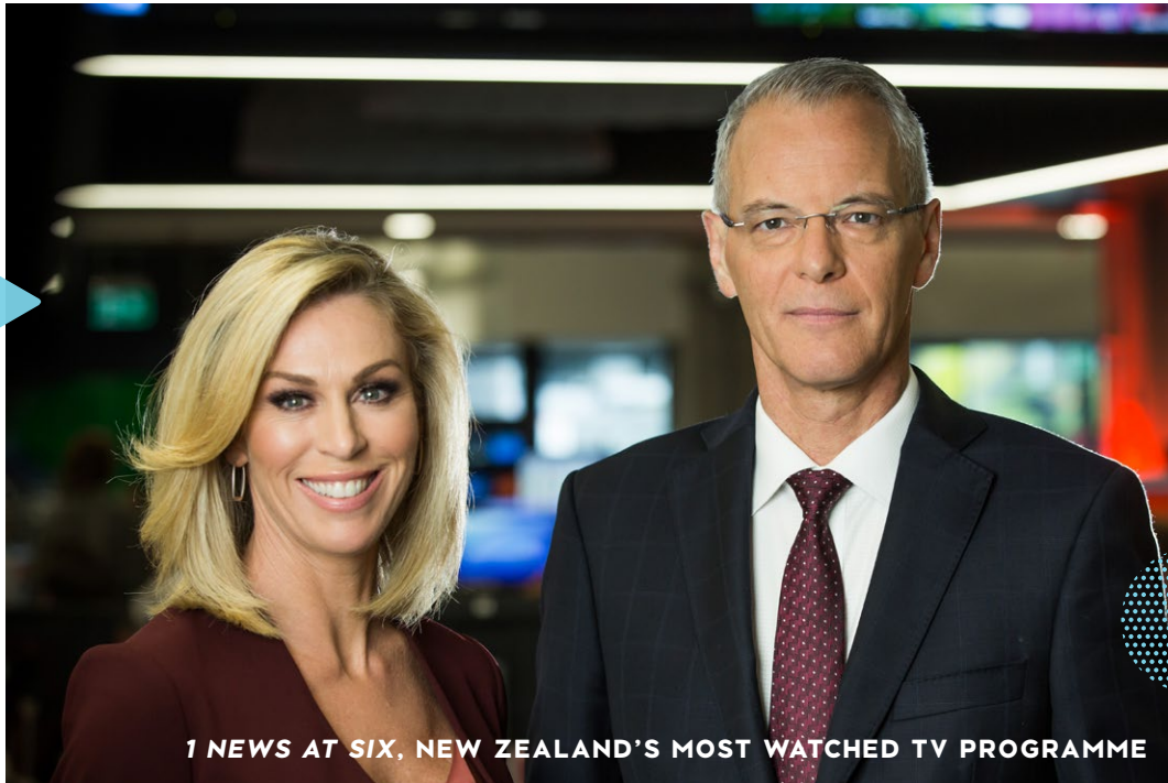
1 NEWS AT SIX, NEW ZEALAND'S MOST WATCHED TV PROGRAMME